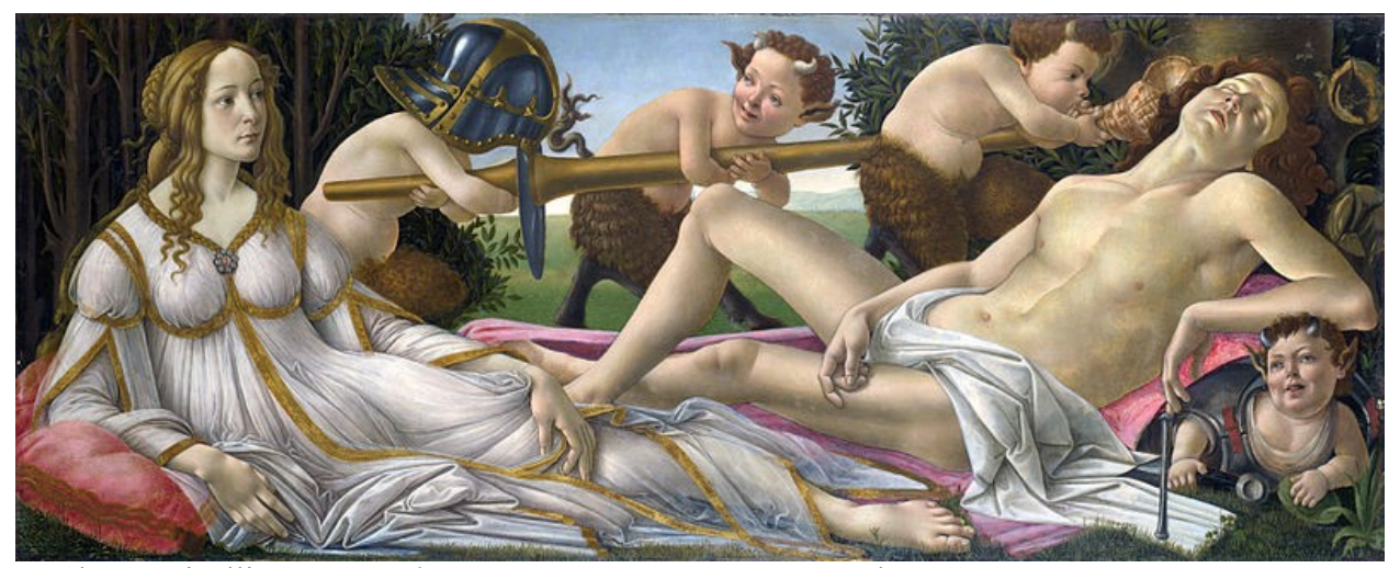
Sandro Botticelli, Venus and Mars, c 1483. Tempera on panel.