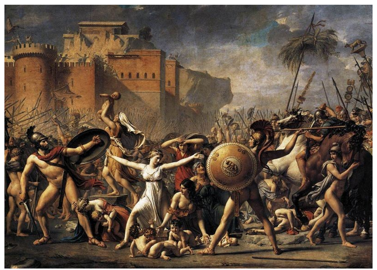
Jean-Louis David, L'intervention des Sabines (1799)

The course is designed to focus critical attention on the cultural value of the Erotomachia as an enduring meme by which gender troubles may be trumpeted, sexual hierarchies destabilized, political forces marshaled, and sexual violence confronted.