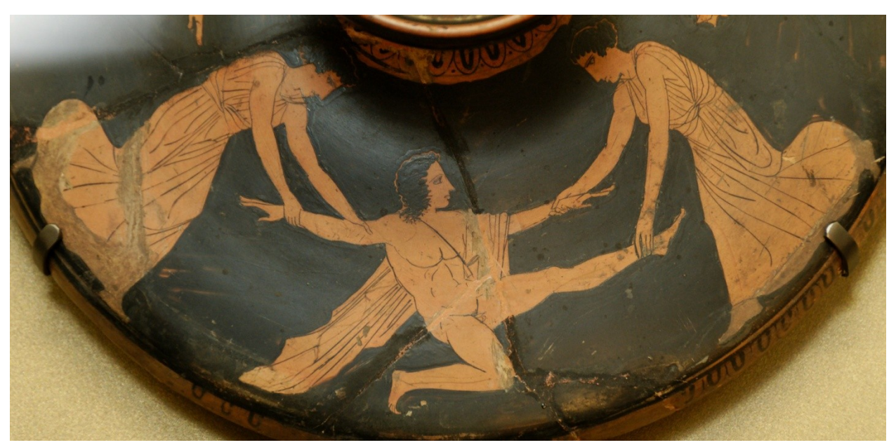
Pentheus torn apart by Agave and Ino. Lid of an Attic red-figure bowl, ca. 450-425 BC.